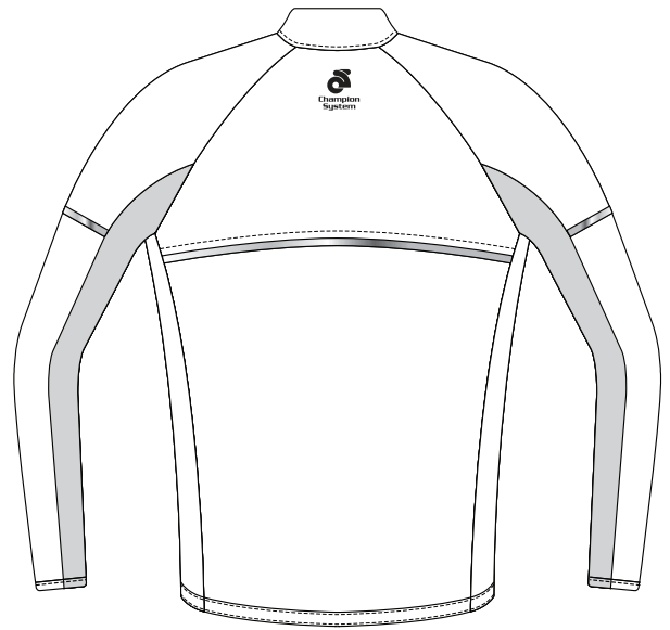
: Back View :